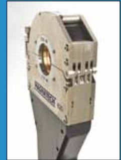
Indestructible stainless steel hinge provides rigidity for positive tube alignment.