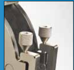
Vernier adjustments allow clamping force to be optimally set. Prevents deformation of thin wall tube.